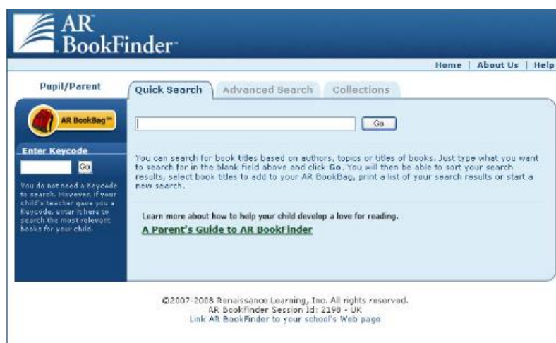
A Screen Shot of AR Book Finder ( www.arbookfind.co.uk )

Visit www.arbookfind.co.uk and click on Advanced Search. By conducting an advanced search, you will be able to generate book lists that contain titles based on the criteria you enter such as Book Level, Topic, Interest Level and Fiction/Non-fiction, etc.